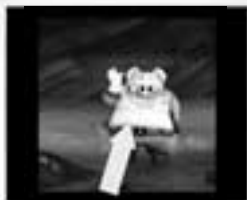
Subject correctly centred.

To direct Jade when fighting, see the Combat & Special Attack section.