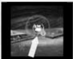
Subject incorrectly centred.

To TAKE A PHOTO , press the "Shift" key to shift into Aiming Mode, use the mouse to direct the camera, the mouse wheel to zoom in or zoom out and focus, and – when you're happy with the framing – press the left mouse button to take the photo.