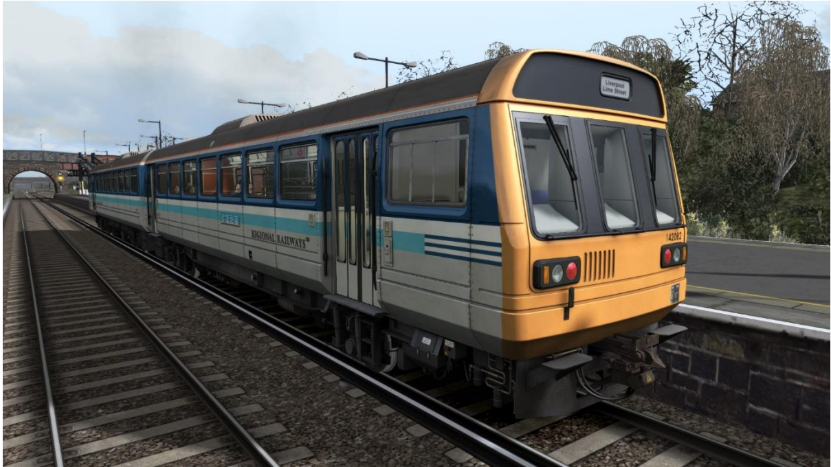
BR Class 142 'Pacer' DMU in Provincial Livery